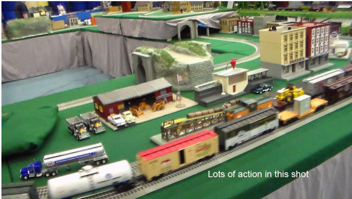
Lots of action in this shot